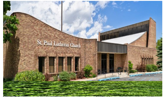
Church Office: 248-541-0613 & School Office: 248-546-6555

"Equip, Support, Serve and Witness Where God Calls Us!"