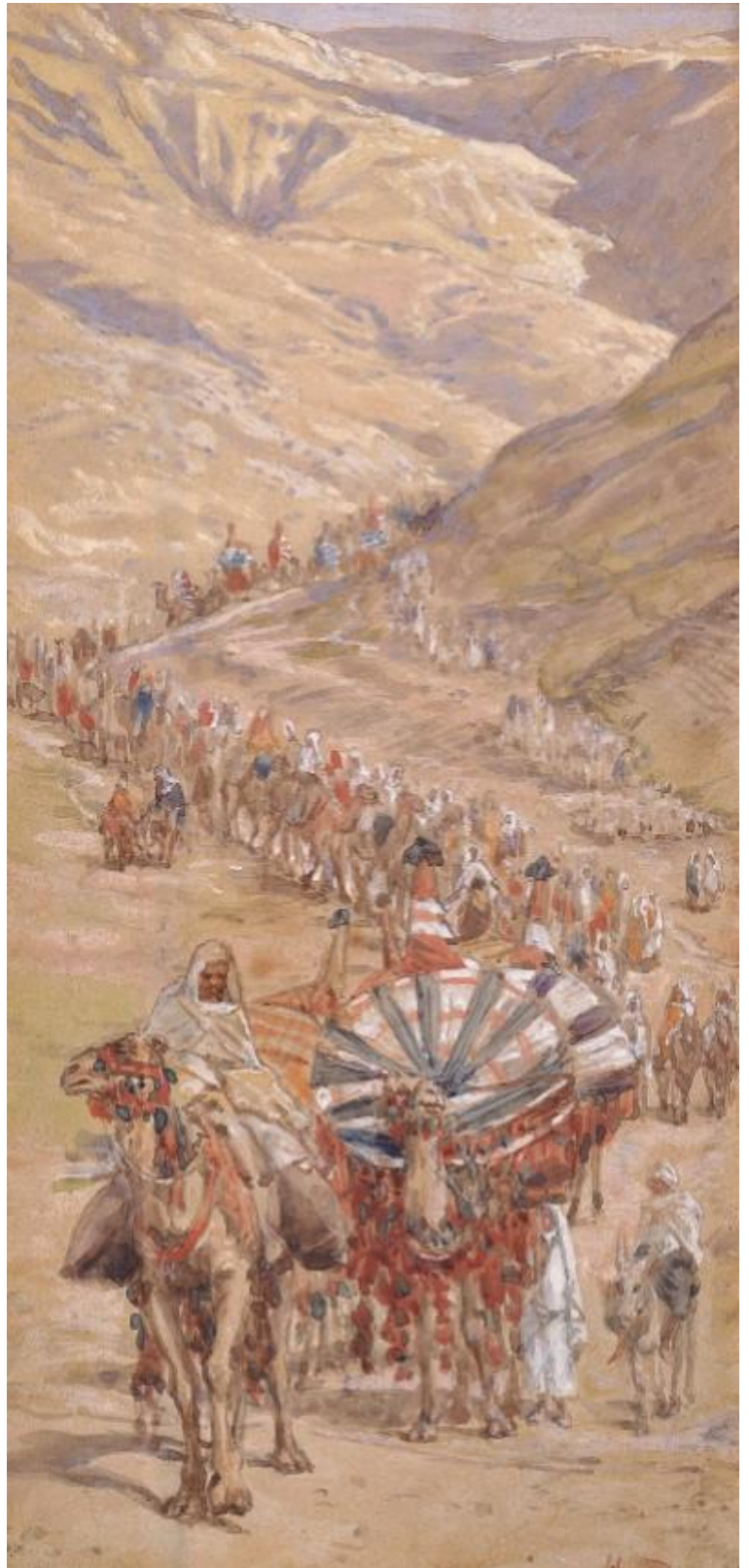
The Caravan of Abraham, watercolor by James Tissot

God spoke to me and told me to leave this country and my father's household. God said he would show me a new place to live.