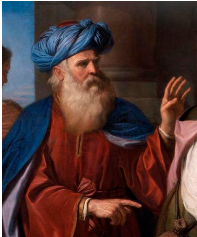
Portrait of patriarch Abraham, painted by Guercino in 1657.

The journey was long, but Abraham had faith. The Promise Land was their destination. Abraham trusted in God to lead the way. God said, "You will become a great nation."