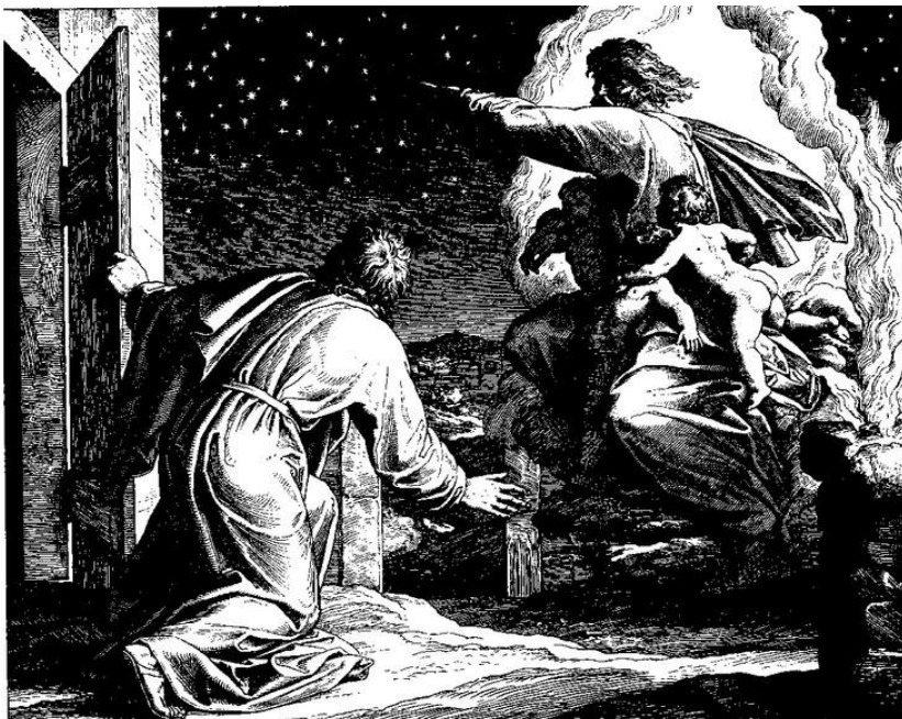
"Die Bibel in Bildern", wood cut by Julius Schnorr van Carolsfeld, 1860

I do not know where the land is I am going to, but God knows. I have faith that God will guide me to my new homeland.