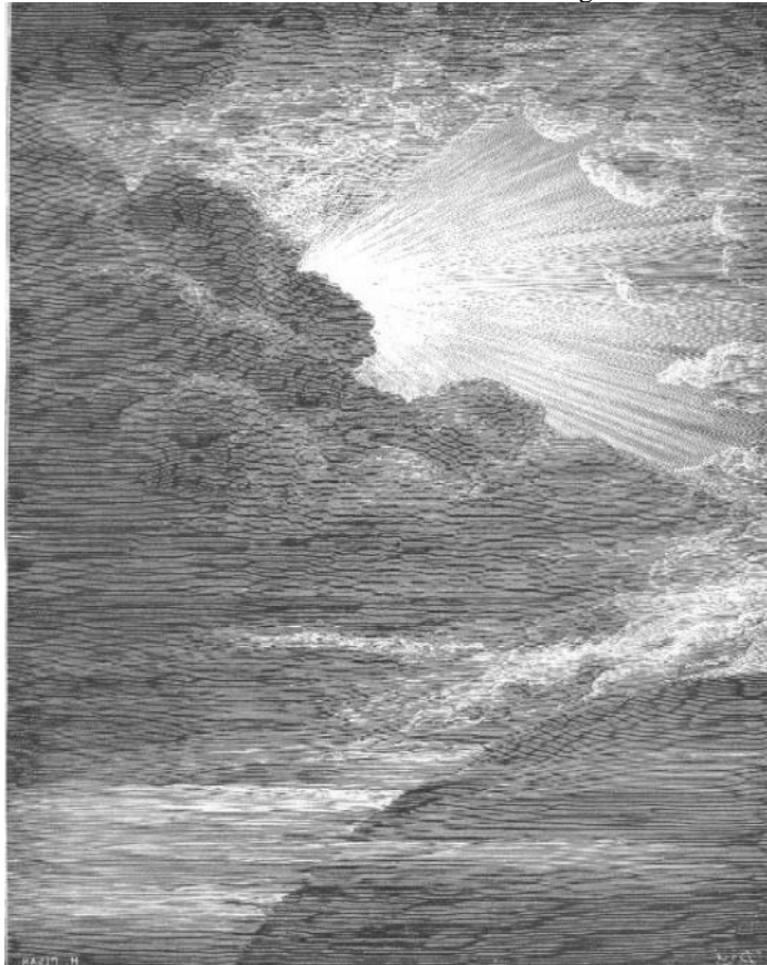
Gustave Doré – The Creation of Light

Prayer: Lord help me always to remember that you are the Creator of the world and the heavens, and of all life. Help me to see your mighty hand when I see the stars, the mountains, the plains, and the oceans. Help me to see the beauty in the colors you painted the world and in the diversity of its life. Remind me that I am to be a good steward. Thank you for the greatest gift of all, the gift of your Son for the forgiveness of my sins, so that I may some day live in Heaven with you. Amen.