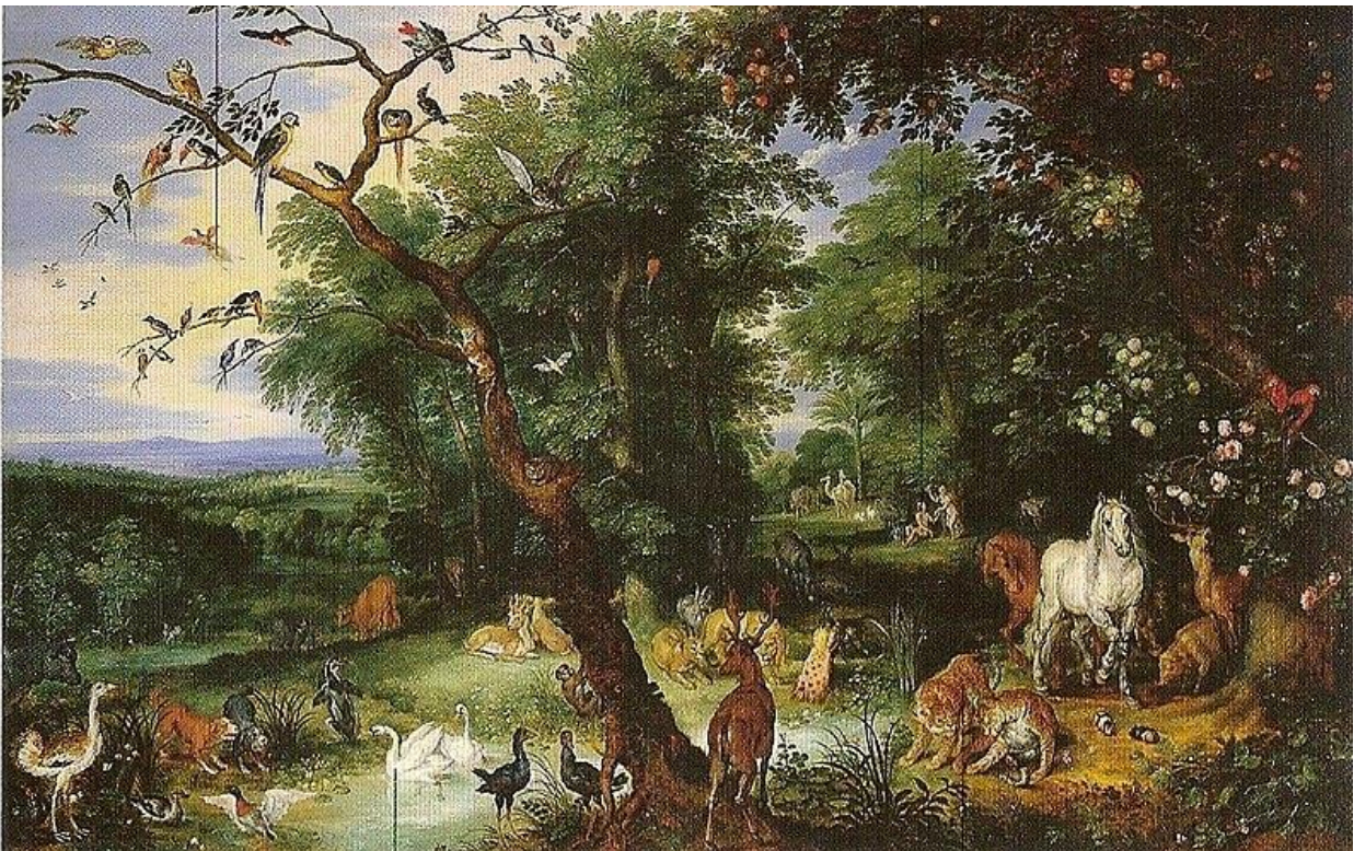
The Garden of Eden. Oil painting by Jan Brueghel, The Elder, 1630

Prayer: Dear Lord God, thank you for making the world. Help me to see the beauty in what you made – the colors of the sunset, the sparkle of the sun on the water, the majestic mountain tops, the graceful flight of birds. Help me to respect and take care of the world you made and the animals who live in it. Thank you for loving me and watching over me. Amen.